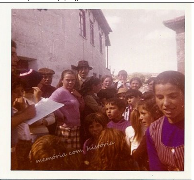
Figure 1. Literacy campaigns in Trás-Os-Montes, September of 1974

Many of these initiatives focused on getting to know the real country, with the goal of shortening the distance between intellectual work and manual labour. One of the main initiatives of this movement of "going towards the people" (Oliveira, 2004a, 2004b) during this period was headed by the Armed Forces Movement (MFA) responsible for the revolution, in the Cultural Promotion and Civic Action Campaigns , reflected in one of its participants' testimony: