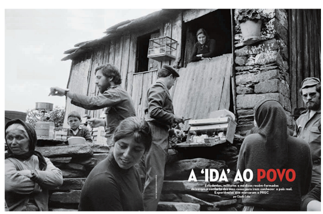
Figure 2. Cultural Dynamization and Civic Action Campaigns conducted by the MFA in the Centre region, retrieved from http://citizengrave.blogspot.pt/2012/12/a-ida-ao-povo.html, and originally published in the magazine "Visão História" [Engl. "Vision History"]

while in Spain it was 35%, in Italy 25% and in France 5% (Nóvoa, 2005). During the dictatorship, from 1930 to 1970, the rate decreased about 40%, "in an average of 10% per decade" (Correia, 1998, p. 87). However, this decrease was very diverse for different age groups.