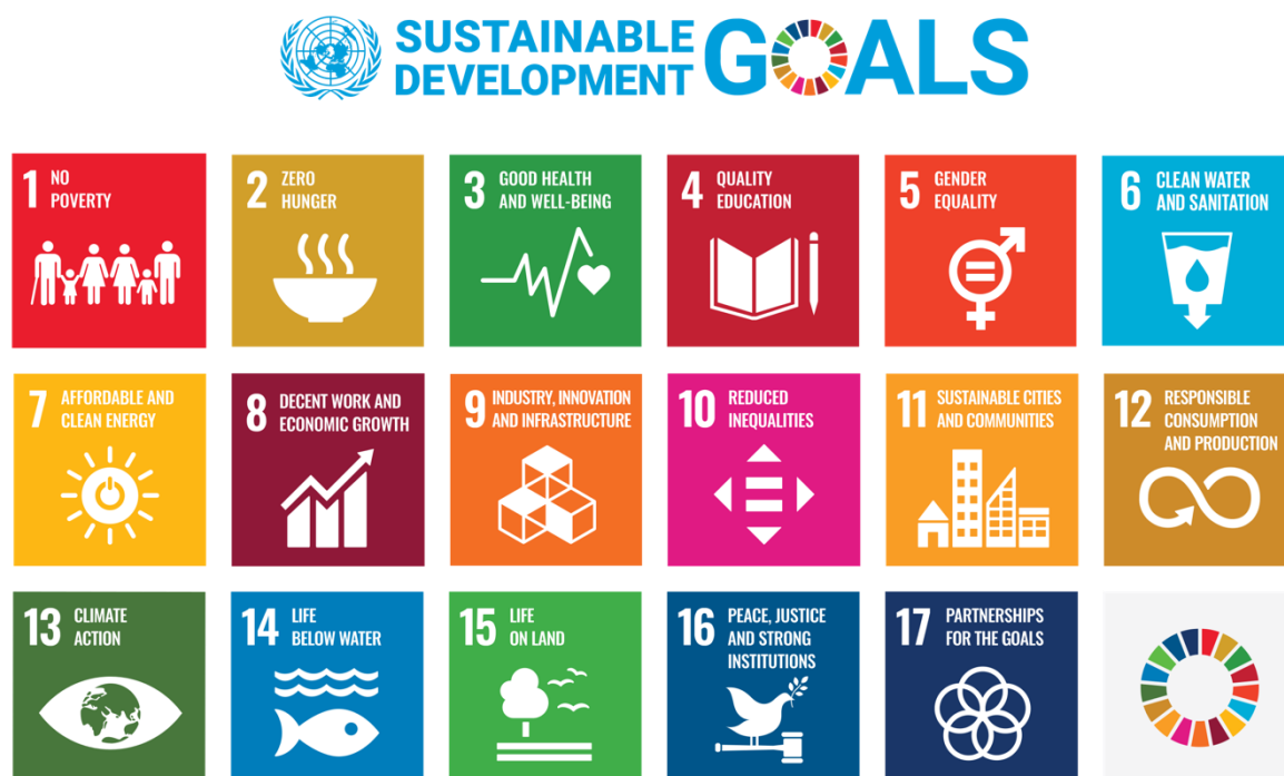
Figure 1. The 17 SDGs of the UN define a full range of targets that should be achieved by 2030.

UNESCO’s response to the urgent challenges facing our planet. Human activities have changed the Earth’s ecosystems so much that our survival is at risk, and these changes are becoming harder to reverse every day. To prevent global warming from reaching catastrophic levels, we urgently need to take action. Education for Sustainable Development empowers people with the knowledge, skills, values, attitudes and behaviors to live in a way that is good for the environment, economy, and society. It encourages people to make smart, responsible choices that help create a better future for everyone. (UNESCO, n.d.a, n.p.)