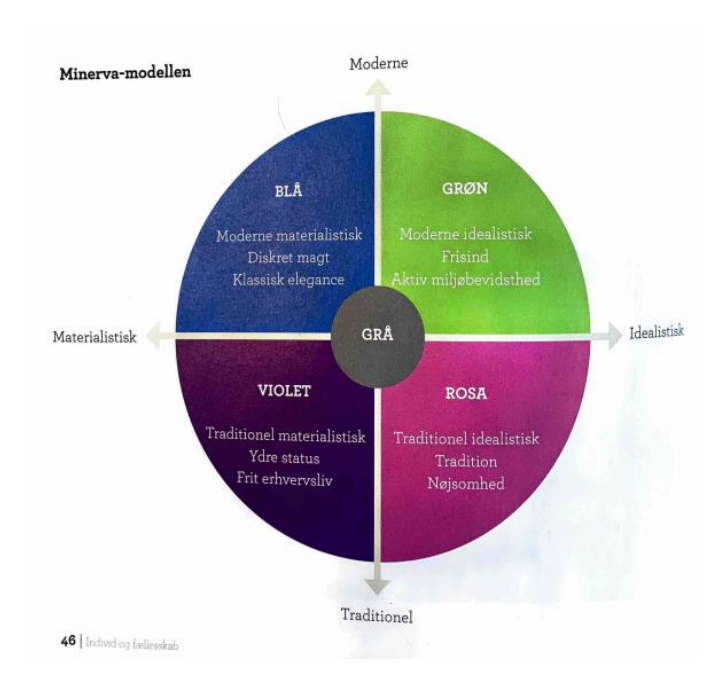
Figure 4. Illustration of the Minerva model from the students' textbook (Christensen & Trojaborg, 2021, p. 46)

Teacher: We can conceive of the model as telling us something about not only lifestyles but also consumption. Can you define what a pink personality is and whether you have some consumption that can exemplify it?