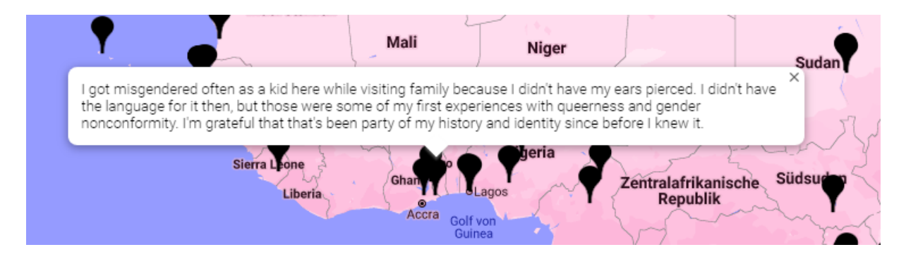
Figure 3: Quotation from a place dotted in the Queering the Map project (Queering the Map, n.d.)

"I got misgendered often as a kid here while visiting family because I didn't have my ears pierced. I didn't have the language for it then, but those were some of my first experiences with queerness and gender nonconformity. I'm grateful that