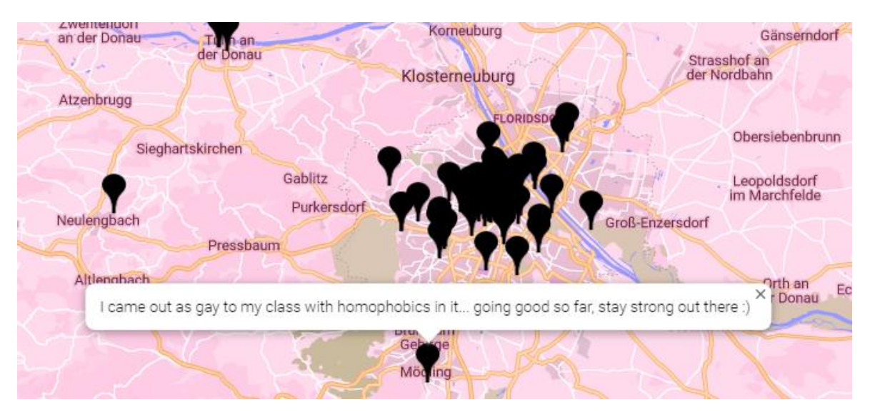
Figure 1: Quotation from a place pinpointed in the Queering the Map project. Source: Queering the Map (n.d.).

This quotation is taken from the Queering the Map project. The short text tells readers that somebody outed him- or herself amid concerns about sexual diversity. Because there seem to be "homophobics" in this specific class in Vienna/ Austria, this outing was probably irritating to others in the class. There is no doubt that the person had difficulties with outing him- or herself and because of that, he or she caused some trouble by demonstrating resistance to classmates' attitudes by so questioning gender normativities. This trouble is caused, because apparently a hegemony is questioned. By using the project map like this person, other people can be encouraged to be irritating and get in trouble. This paper will discuss (im)possibilities of such trouble making and according to aspects of irritation as a starting point for innovation processes in the framework of Geography and Economic Education based on queer theory.