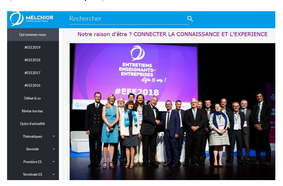
Figure 2: Page of the "Melchior" site presenting a stage photograph taken during the 2018 edition of the "Teachers-Business Talks" where business leaders, economists, director of the Ecole Polytechnique and inspectors from the French Ministry of Education are mixed together.

It is thus launching a website offering educational resources called "Melchior", and offers immersion internships in companies to teachers of the discipline as well as, since 2003, an annual 2-days conference just before the start of the school year, initially named Entretiens Louis-le-Grand ("Louis-le-Grand Talks") after the prestigious Parisian high school where they are held. They are renamed Entretiens Enseignants-Entreprise ("Teachers-Business Talks") after their move to the Ecole Polytechnique, only a few kilometers from the Mouvement des Entreprises de France (MEDEF, French Companies Movement, the major employers' organization) Summer University