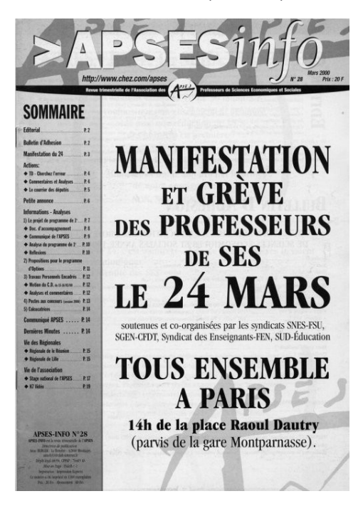
Figure 1: Frontpages of the APSES newsletter, respectively calling for a strike and demonstration by SES teachers in March 1996 and showing the national office of the association interviewed by the Minister of National Education in 2008

a dedicated Certificat d'Aptitude au Professorat de l'Enseignement Secondaire (CAPES, Certificate of Aptitude for Secondary School Teaching-) in 1969, then an agrégation in 1977<sup>9</sup>, the creation of the SES Teachers' Association in 1971, discipline-specific textbooks and journals - in particular the independent monthly magazine "Alternatives économiques", created in 1980 specifically for SES students and teachers - and the creation of preparatory classes for the "grandes écoles" focusing on SES in 1982-1983<sup>10</sup>.