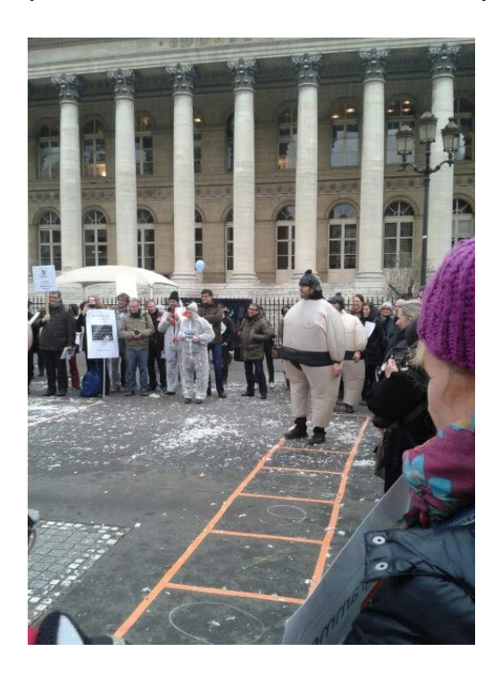
Figure 4: (right) Rally organized by APSES to demand a reduction in SES programs on 29 November 2012 in Paris. (© APSES) (left) Posters produced by APSES using famous expressions of economic and social science personalities to promote SES (© APSES)

play symbols to get noticed by the media. Thus, in November 2012, in order to demand relief from the new SES programs, which it considers too large in view of the time constraints, APSES decided to organise a rally on the Paris Stock Exchange square, also adjacent to the Agence France Presse building, rather than a traditional demonstration with a strike on a Wednesday afternoon. A major goose game is organized with activists disguised as ducks and sumo, to symbolize the force-feeding that students would undergo. And the rally ends up with a release of balloons to which each one is attached a notion from the new programs. Although it is not possible to attribute a direct effect to this event, it may be noted that SESs are then the only discipline to obtain cuts in their programs.