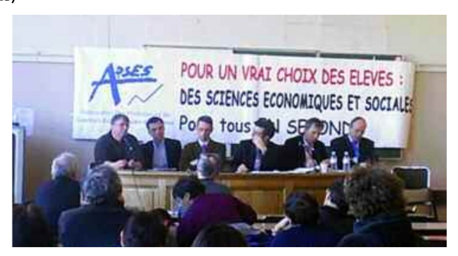
Figure 5: Assises nationales des SES organised by APSES at Sciences Po Paris in 2005

However, it must be noted that despite this resistance and the militant resources that APSES knows how to mobilize, the founding project of the SES is increasingly called into question with each curricular reform. While the programs of the early 2000s still respect this spirit, with the option in Year 11 being the successive study of the family, employment, production and consumption after an introductory chapter leaving teachers the freedom to deal with the subject of their choice to show the "SES approach" and the complementarity of economic, sociological and political perspectives with a timetable of two and a half hours per week (including 30 minutes in half class). Year 12 is organized around the study of the economic link, sociological link and political link. In Year 13, a "speciality" teaching was added to the common program focused on "growth, social change and development", although the complementary indications have become increasingly voluminous. In this optional teaching, which is in addition to the five hours per week, the aim is to cover each of the main themes dealt with on the basis of the writings of a named author (Schumpeter, Smith, Tocqueville, Marx, Weber, Keynes or Ricardo), while showing their current relevance. A real deepening that is highly appreciated by both teachers and students.