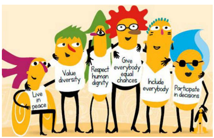
Figure 2: Democracy and Human Rights Start with Us – Charter for All (http://www.coe.int/en/web/edc)

In the diagram Active Citizenship Composite Indicator (Figure 3, cf. Hoskins & Mascherini, 2009, p. 469), there are four dimensions of citizenship activities and competencies. These four dimensions try to combine and to include different approaches to citizenship and democracy theories.