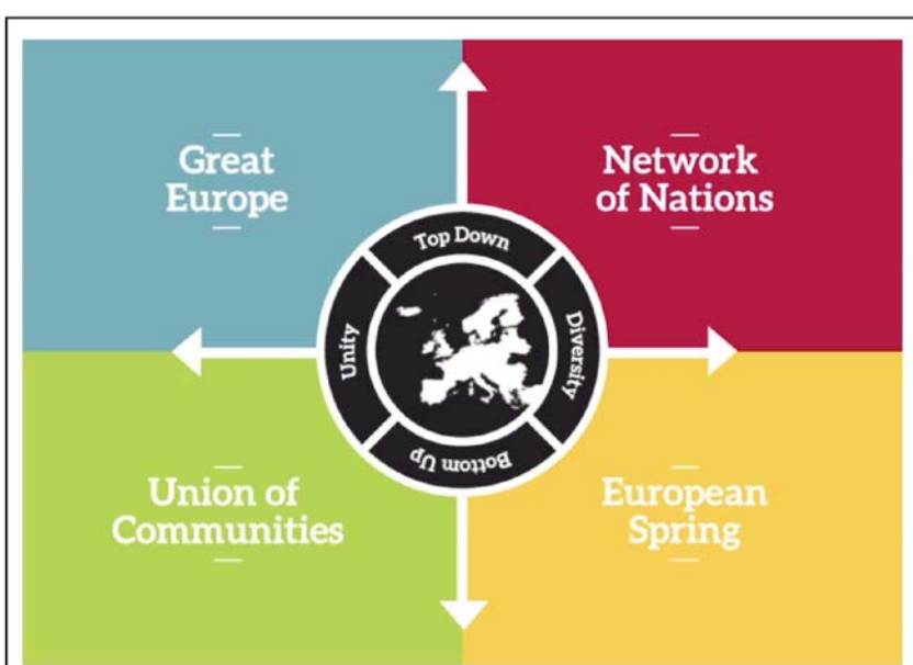
Figure 1: Four scenarios on the Future of Citizenship in Europe 2030 (NECE 2013, 5)

Europe. If we look at the two "bottom-up" scenarios, we get an interesting picture of the ambivalent future role of societal actors — perhaps not too dissimilar from our current situation.